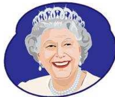
Queen Elisabeth II